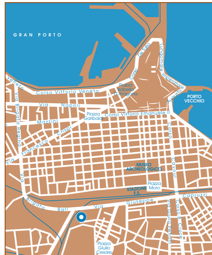
● Villa Romanazzi Carducci